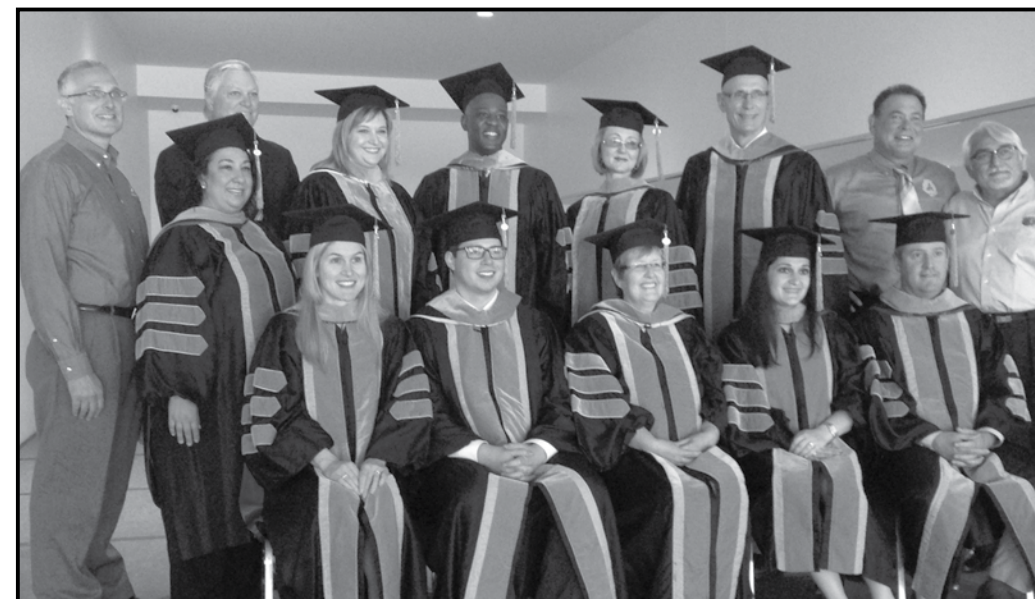
All Region IX Fellow and Mastership Awardees

The convocation was held in Detroit at the National AGD convention. For more information on how to attain the awards of AGD Fellow and Master, please visit www.agd.org !